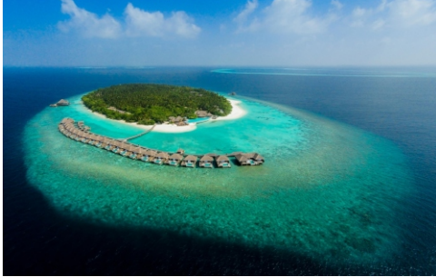
Resort Aerial view