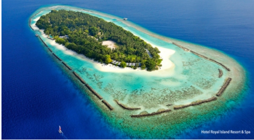
Resort Aerial view