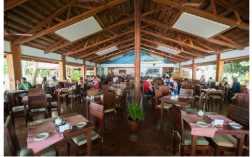
The Rehendhi Restaurant

Distance from Dharavandhoo to Reethi Beach Resort 12 KM