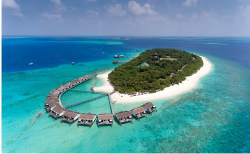
Resort Aerial view