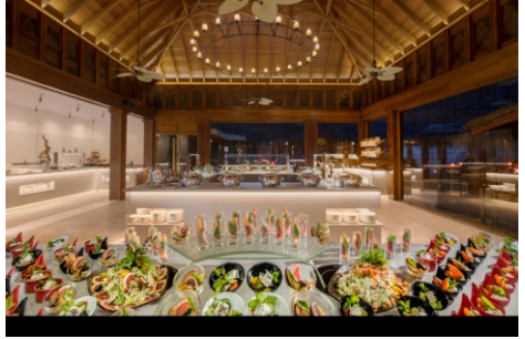
The Market Restaurant

Distance from Dharavandhoo to Dusit Thani Resort 9.5 KM